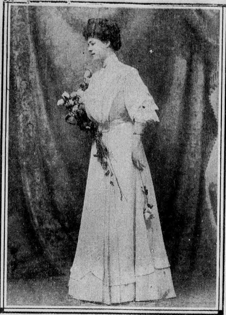
-A YOUTHFUL JUMPER MODEL.

A two-piece jumper dress of pale blue cashmere. The skirt and jumper are trimmed with stitched bands of white satin and the wide stitched belt is of the same material. Mandarin sleeves edged with the satin and trimmed like the jumper waist fall gracefully over the elbow under sleeve of Valenciennes lace ruffles.