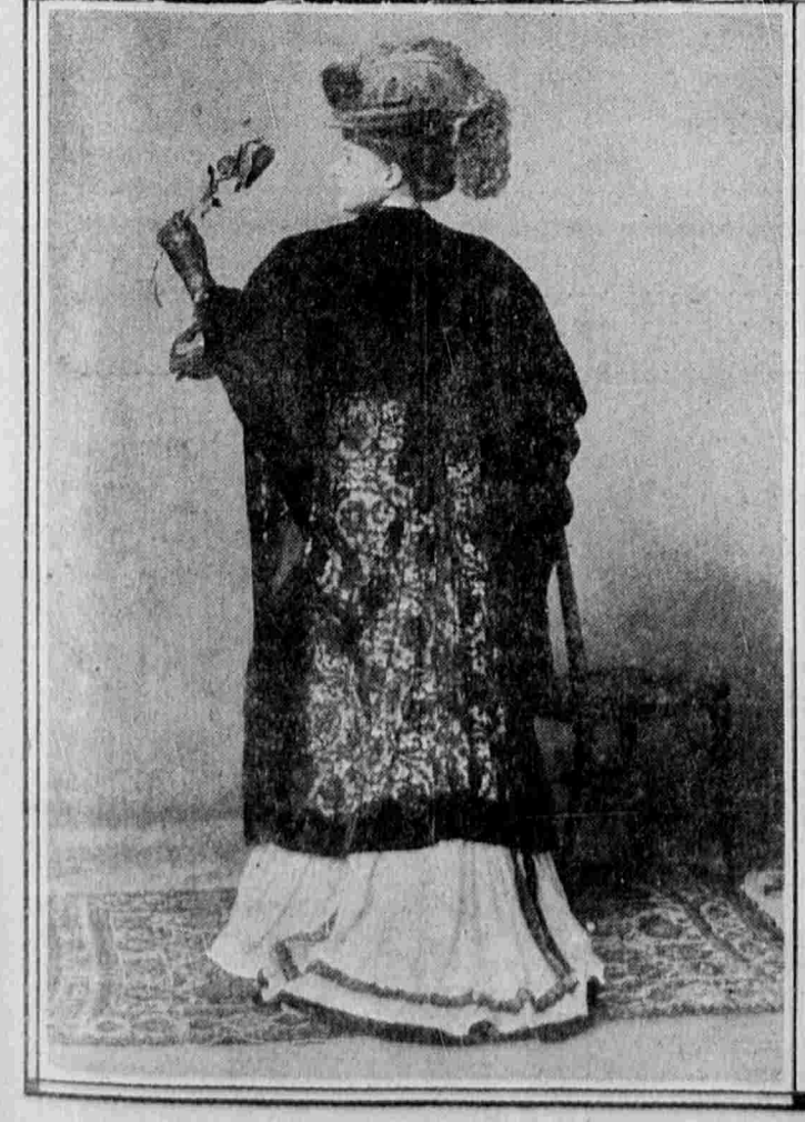
HANDSOME BLACK LACE EVENING WRAP.

The beauty of the black lace evening wrap is charmingly exemplified in this garment of black Venable. The lines are such that it might be classed as a wrap, but it is not for the fact that the sides, bound with black tulle, are slightly tucked under the arms to form a shaglike sleeve. Handsome cord buttons effect a pretty finish about the neck and depend from this point well below the waistline in the back and almost to the skirt hem in the front.