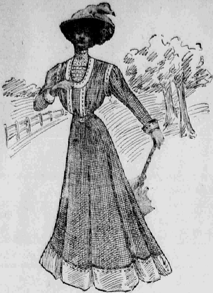
GINGHAM FROCKS ARE SPLENDID STYLE.

White and green checked gingham makes this little tailored dress for morning wear. The waist following the lines of the popular jumper model, is trimmed with bands of white linen braided with green cotton soutache and pipings of dark green gingham. There is a touch of dressiness in the chemise of eyelet embroidery. The skirt is cut in seven gores, fits the hips snugly and flares gracefully about the feet, where it is finished with a wide applied hem of the white linen piped and braided with green.