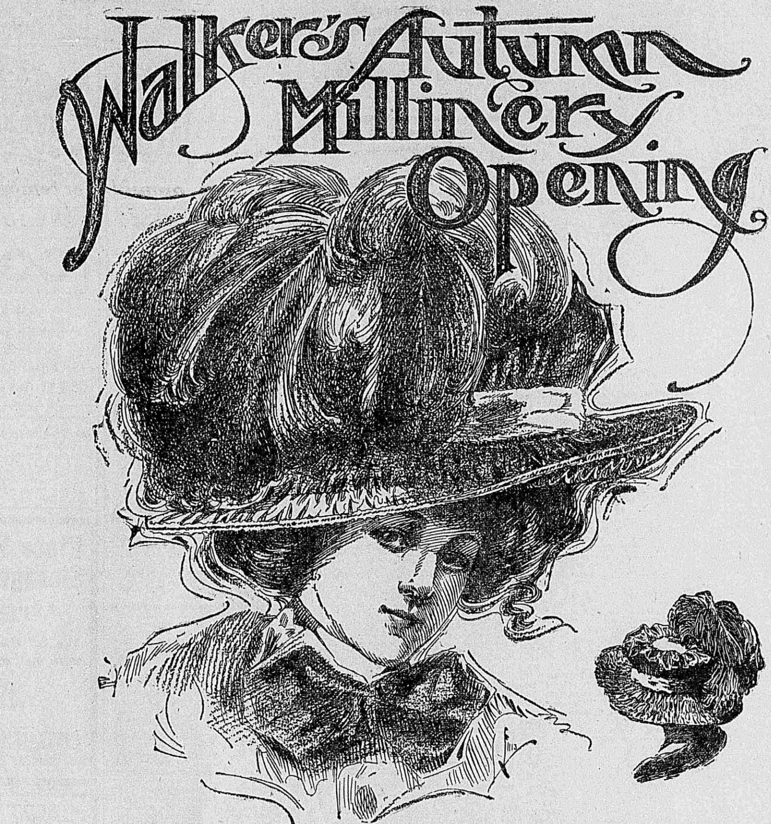
This illustration was sketched from one of our imported models.

On Monday, Tuesday and Wednesday September twenty first to twenty third inclusive, we will display choice models in fall millinery