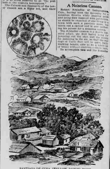
SANTIAGO DE CUBA, "YELLOW JACK'S" HOME.