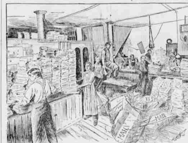
THE NEWS MAILING ROOM ON SEMI-WEEKLY NIGHTS.