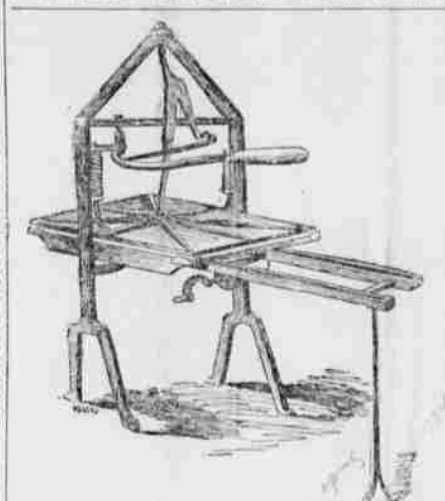
FIRST PRINTING PRESS USED IN PRINTING DESERET NEWS.