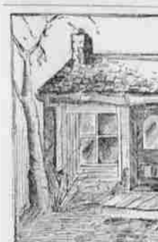
BUILDING IN WHICH THE "NEWS" WAS FIRST PRINTED.