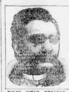
TIRED, WEAK, NERVOUS, Could Not Sleep.