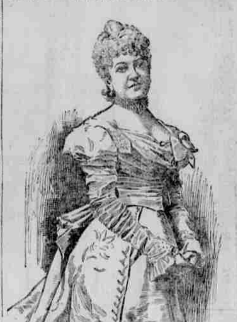
MRS. FRANK LESLIE AND HER MAGNIFICENT STUDY.

She was the first woman to be the publisher of a newspaper in this country. She was the first woman to be the publisher of a magazine in this country. She was the first woman to be the publisher of a newspaper in this country. She was the first woman to be the publisher of a magazine in this country. She was the first woman to be the publisher of a newspaper in this country. She was the first woman to be the publisher of a magazine in this country. She was the first woman to be the publisher of a newspaper in this country. She was the first woman to be the publisher of a magazine in this country.