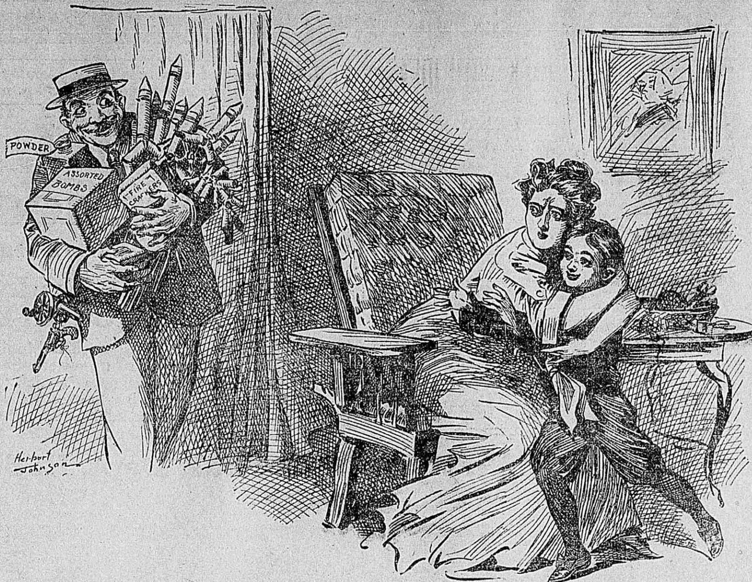
A FOURTH OF JULY STORY—Chapter II.