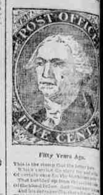
FIFTY YEARS AGO.

STUDY TAKES NOTES. The illustration shows a man sitting in a chair, looking thoughtful or distressed. He is wearing a suit and tie. The illustration is simple and appears to be a woodcut or engraving.