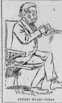
STUDY TAKES NOTES

The Atlantic Express No. 1, which was en route from Reno to Salt Lake City, was wrecked on the Nevada coast. The train was thrown off the track by a broken rail, and three Indians were killed. The train was carrying a large number of passengers, and the wreck caused a great deal of damage.