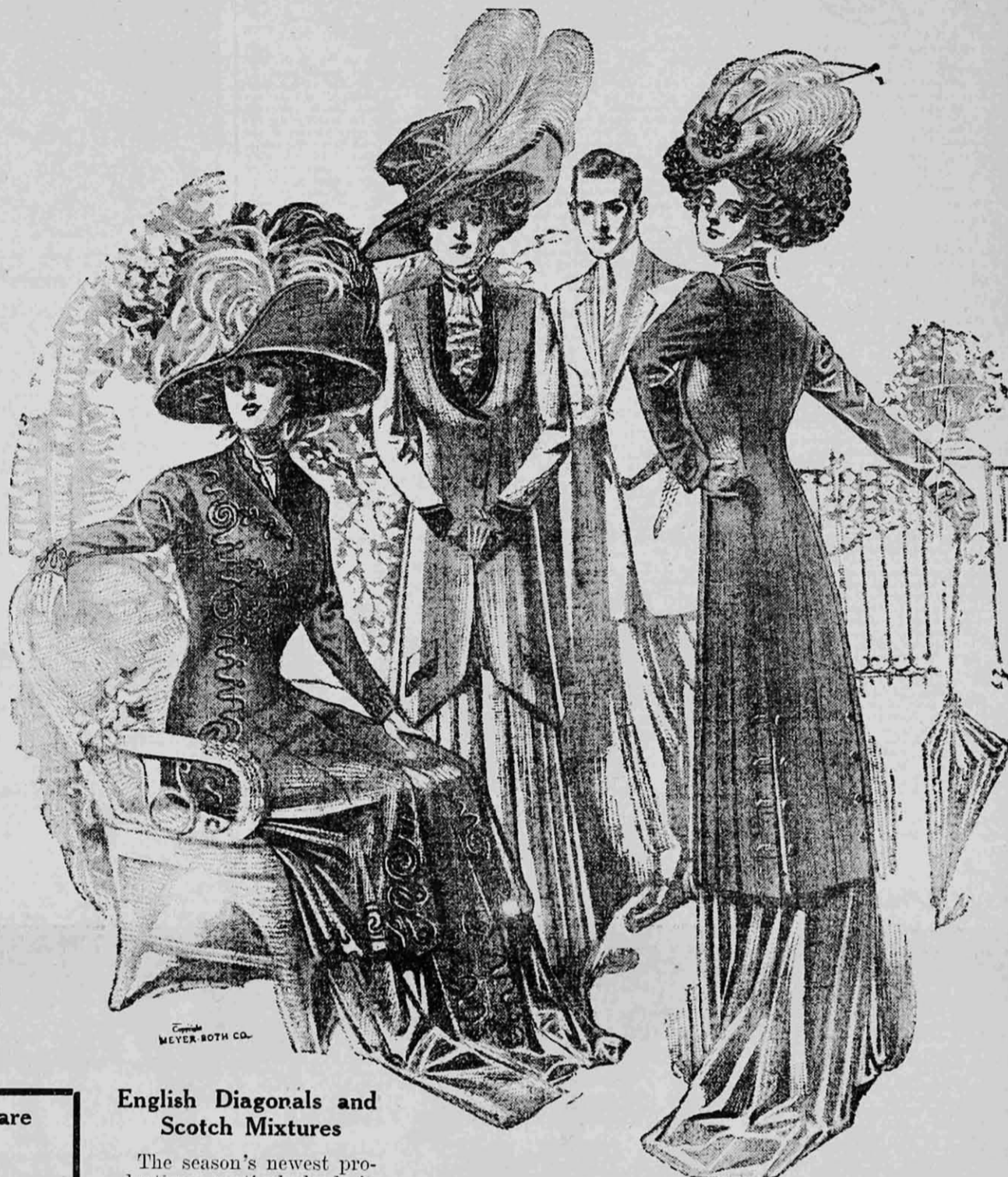
English Diagonals and Scotch Mixtures

23-inch Umbrellas, good, strong frames, bought especially for the little ones to carry to school in stormy weather. Regular price $1.25, special. . . . . 85c