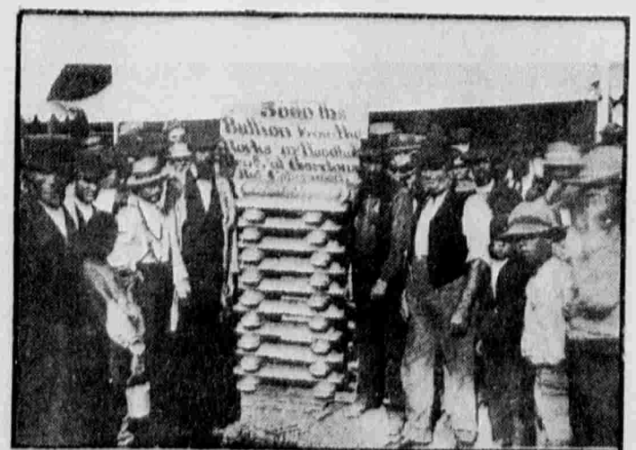
First shipment of bullion—in front of Walker's store—1863.