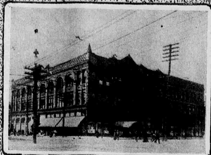
Present completed structure—the largest dry goods department store in the middle west.