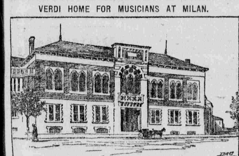
VERDI HOME FOR MUSICIANS AT MILAN.

The picture shows the handsome building which under the terms of Verdi's will is designed as a home for old and poverty stricken musicians. It is at Milan, the great composer's home, and is one of the most attractive modern structures in that beautiful city.