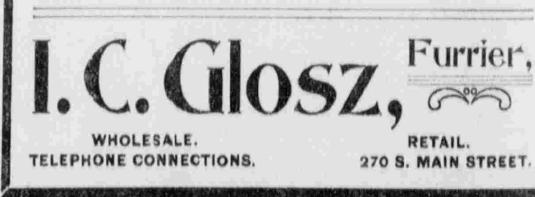
AN ELEGANT LINE OF Ladies' Cloaks, Suits and Furs HAVE JUST BEEN "PENED UP FOR INSPECTION.

ST JE ARE SHOWING all the New and Up-to-date Designs, and an assortment of such breadth as to give satisfaction to the most fastidious taste. One of the jauntiest suits we are showing this season is made with a straight front coat, broad-cloth vest, and the popular round length skirt,