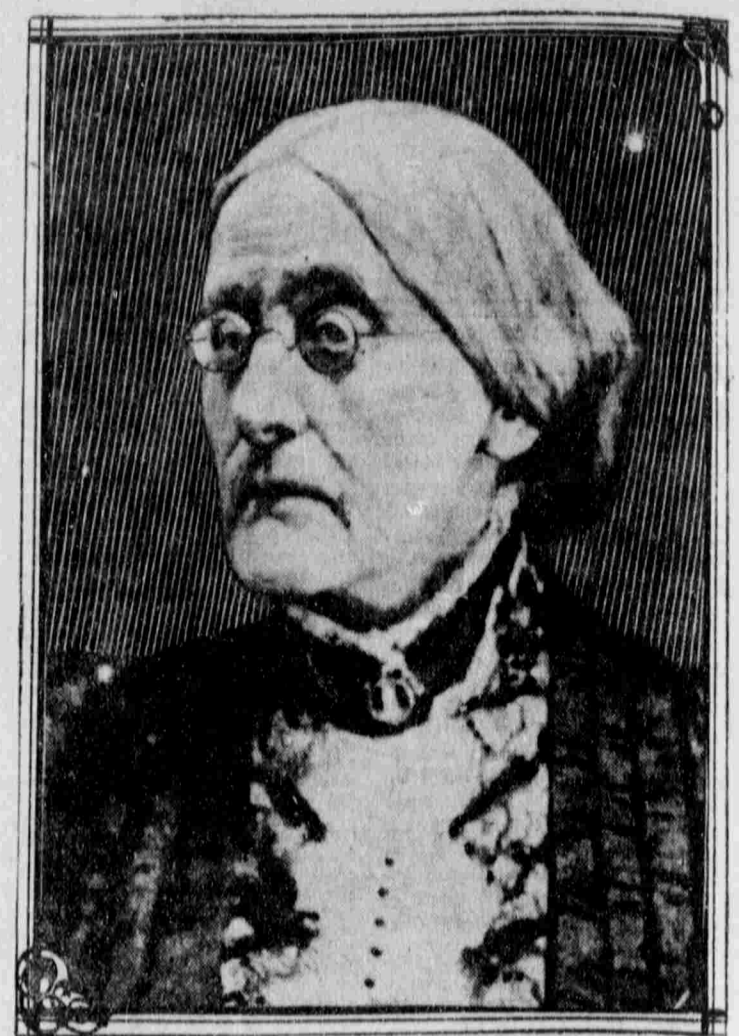
SUSAN B. ANTHONY

The Hanover club of Brooklyn is to honor the 55th birthday of the great woman suffragist, Susan B. Anthony, on Feb. 15, with a banquet. Though the organization is working along lines, and Miss Anthony's life work, have been contrary to what most men believe in, yet "mere man" will be admitted to this affair.