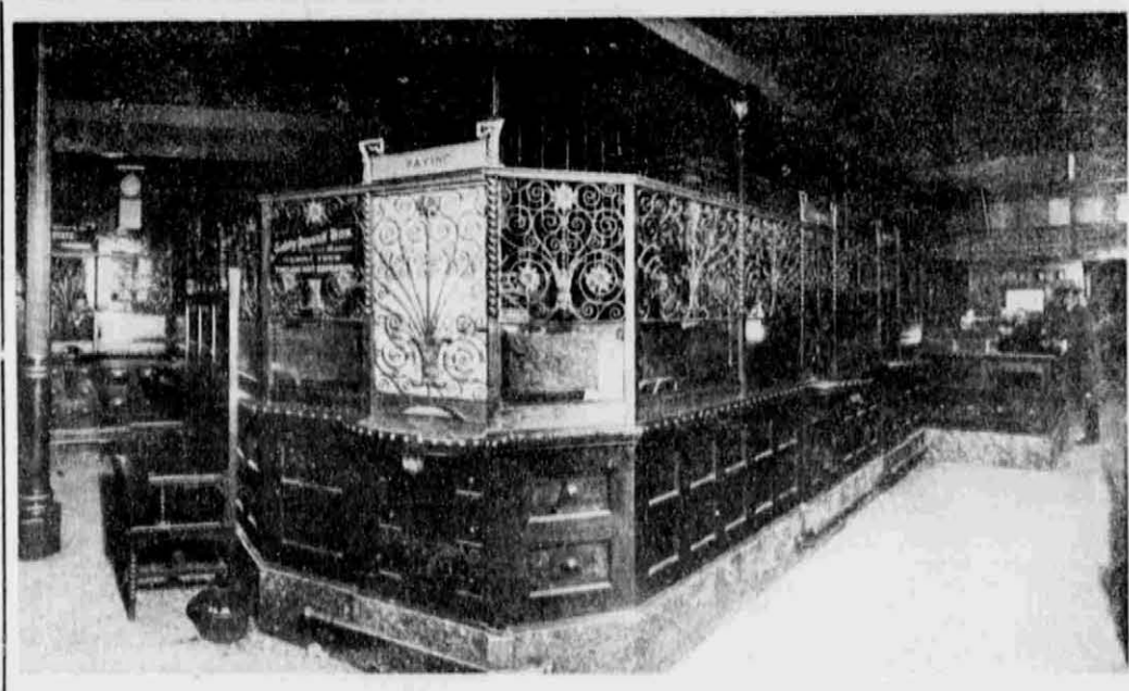
INTERIOR VIEW OF THE UTAH NATIONAL BANK.