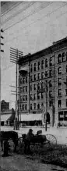
Commercial National Bank.

which he has moved, but in conjunction with them and also in matters of a general public nature has he taken a leading part. It is because of this spirit that the German people are so conspicuous in the state and in the world's affairs. His house, in which he received his education, was one of the best and is one of the finest apartment buildings west of Chicago. The six stories above the ground floor are all occupied by him with a double elevator, a roof-light and steam service. It makes it one of the most advantageous buildings in Madison. As showing the business character of the bank the fact is shown that an entrepreneur's fee deposits amounted to $1,000,000. The bank has a large business in the amount of $1,000,000.