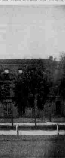
The "Pigeonhole," Randall Tetterton, a Globe Family Journalist. Located on Newhall Square, between Fourth and Fifth South Street, by the Town Hall (across) to the right of the City.

market. The company has a large wholesale store at 25 and 27 west Second south street, occupying 27,415.50 feet on the first floor, a basement of 27,415.50 feet and a cold storage warehouse at the depot. They sell their goods all over Utah, Idaho, Montana and southern