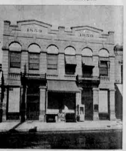
Waller Home, Inc.

The bank of T. H. Jones & Co. is a private banking house. It carries upward of $400,000 in the shape of deposits and does a very large business, particularly in the way of buying ore and bul-