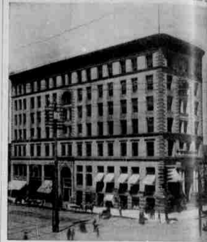
McCombs &amp; Co. Inc.

This book is one among the foremost financial institutions in Bull Lake. As seen by a picture on this page, the