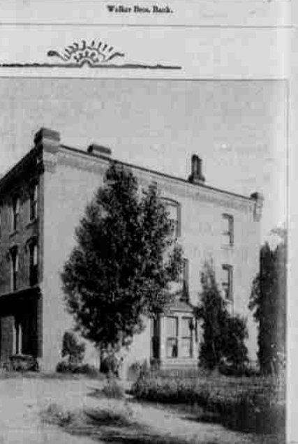
Randall Dutton Twelve Three Story Brick House Select for Family Housing No. 426 North, West Temple Street, on Hayhall Street