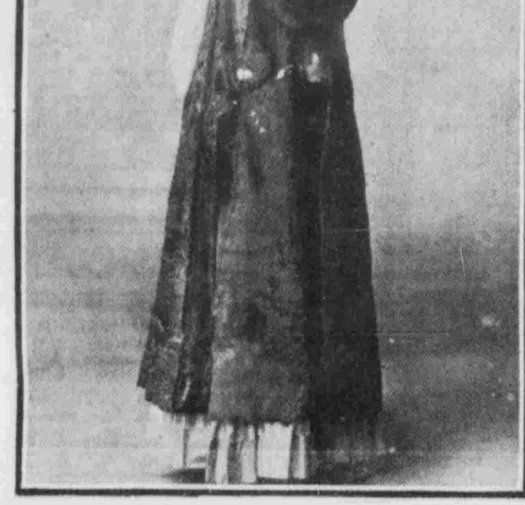
A SMART WAY TO CARRY THE UTO VEIL

The younger set is looking forward with no little interest to the elaborate preparations being made by the mombers of the Governor's club for their mid-winter dance which will be given at the Odeon on next Friday avening. at the Odeon on next Friday avening. Feb 5. The club recens as usual will be gaily decorated in honor of the accasion and it is also promised that