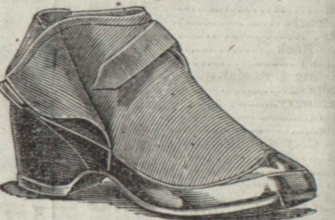
Snow Excluder Open.

Showing how the snow and water are excluded.