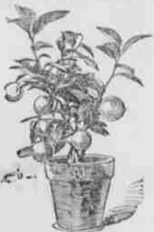
ORANGE PLANT AS A POT PLANT.

Within the last few years, the little orange plant has come to be a popular one. The little orange plant is not only a plant to be grown in the garden, but it is also a plant to be grown in the house. It is very easy to grow, and it is very beautiful. It is very easy to grow, and it is very beautiful. It is very easy to grow, and it is very beautiful.