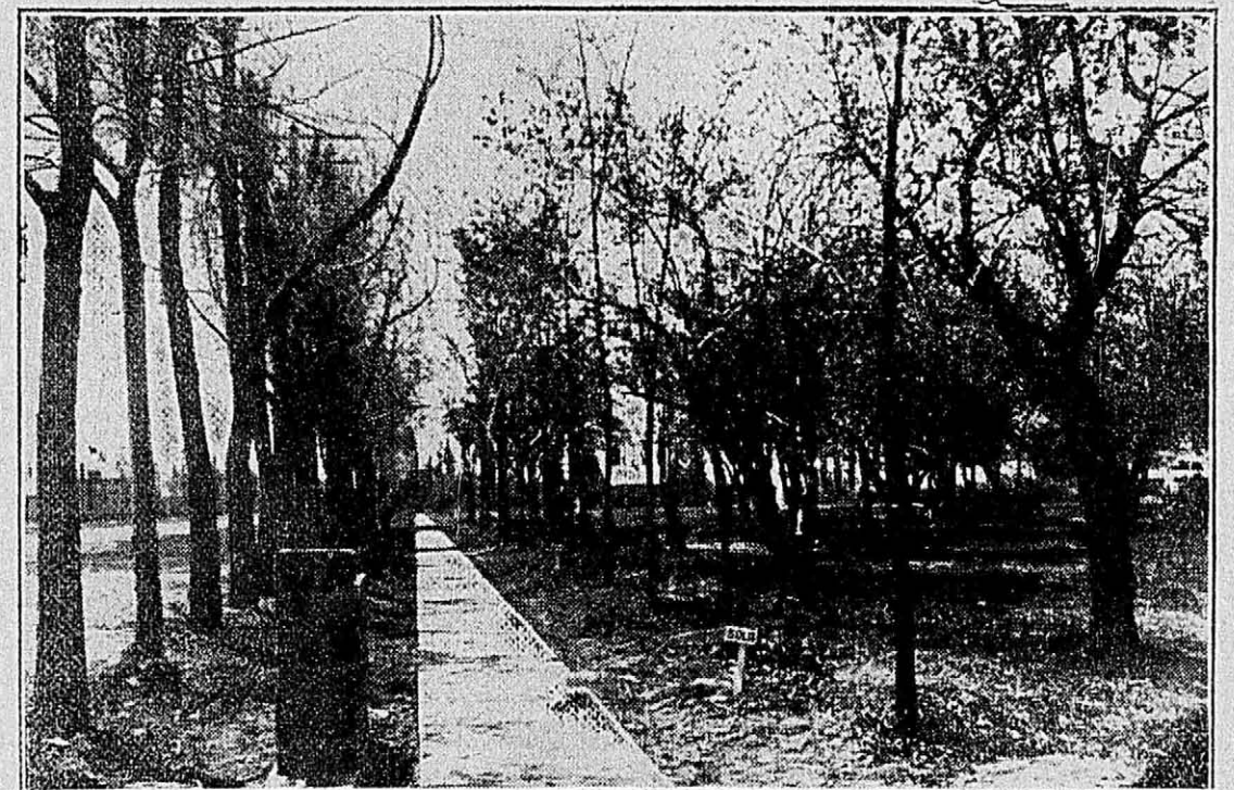
A VIEW OF SOUTHGATE PARK—STATE STREET FRONTAGE.

Lots $5 down, $5 Monthly. $100 to $180 each.