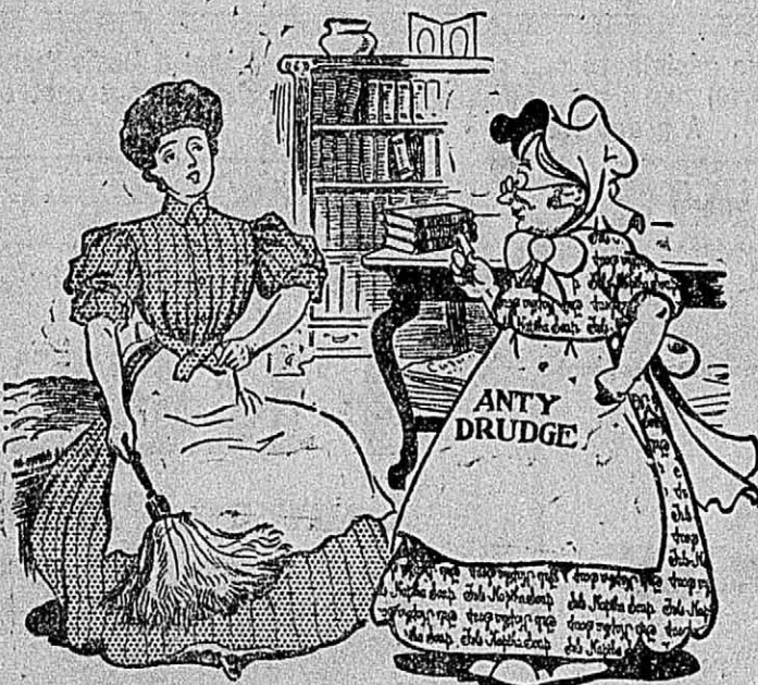
Anty Drudge on Literature.