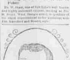
Portrait of a man, likely related to the medical or deafness advertisement.

Effective Sept. 11, 1893. The Through Car Line is now in operation and the public is invited to use it.