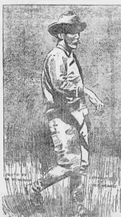
GENERAL WOOD, THE MAN WHO LEFT THE SANTIAGO BRAMS TO COME TO MRS. MCKINLEY'S AID.

Call and get our prices and you will find that they are right.