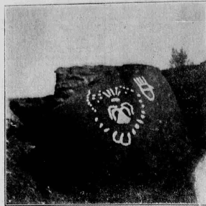
HANDIWORK OF FORGOTTEN REDMEN.

If space would permit we might trace these people, cast away from Asiatic jungles on our northwest coast, where after resting many years and perfecting their tribal organizations, they undertook to follow that instinct which prompts us to look for better conditions. The star which led the pilgrim fathers to the western continent no doubt guided these savage hordes on their long pilgrimage from a chill, bleak country to a land of sunshine and plenty. The long journey up the Columbia and Snake rivers where, seeing a pass to the south, they followed the mountain stream we call the Portneuf, after the old Canadian trapper buried somewhere on its banks. Here where Pocatello now stands they must have rested