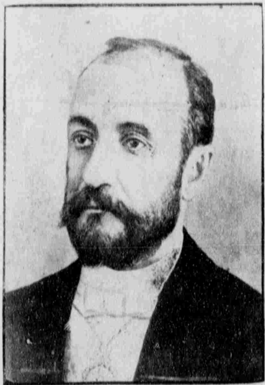
PRESIDENT PANDO, Who Offers $10,000,000 to an American Syndicate.

(Special Correspondence of the Deseret News by Frank G. Carpenter.)