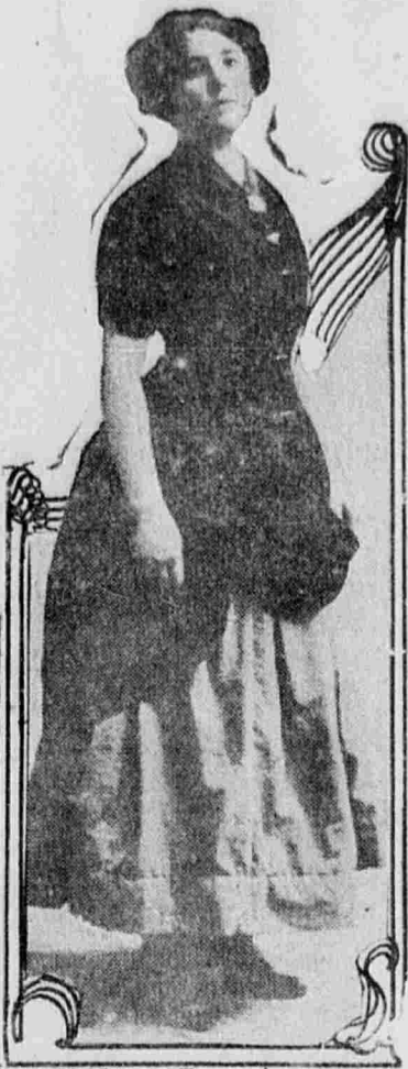
PRETTIEST GIRL IN NEW YORK.