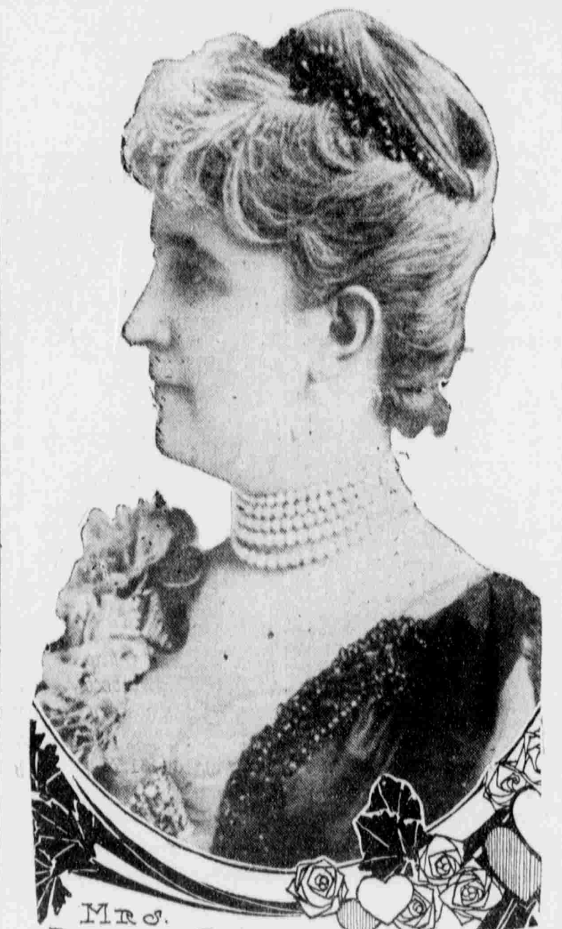
Mrs. POTTER PALMER.