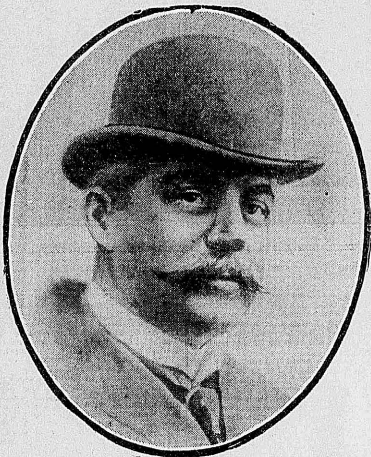
NEW GERMAN AMBASSADOR.