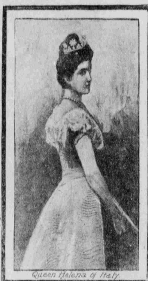
Queen Helena of Italy

It is said that the birth of a son to Queen Helena of Italy is likely to result in bringing about peace between the pope and the king of Italy. If it should, Queen Helena, already much beloved of the people, will become immensely more popular.