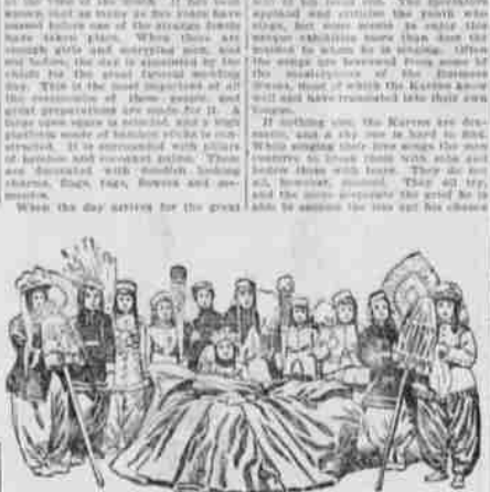
A NEPALESE DANCE IN RITUAL ATTIRE.

world's goods and a belief in the future life. The bride and groom are then seated at a table in the front of the church. The bride is then seated at a table in the front of the church. The bride is then seated at a table in the front of the church.