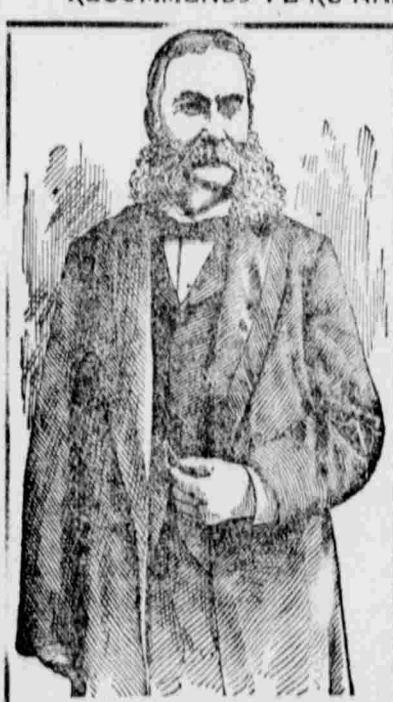
Gen. James Longstreet.

Of the great Generals of the Confederate army in the United States few remain. The most conspicuous figure among these is General James Longstreet, of Gainesville, Ga. His loyalty and courage in defending the lost cause, won the admiration of the world. As a survivor of that splendid chivalry peculiar to our Southern States two generations ago, General Longstreet is one of the most unique men of this age. He is a man of few words, but when he does speak his opinions are accepted by his fellow countrymen with profound respect, if not reverence. In commenting upon Peruna, the old General made use of the following language: "I can testify to the merits of Peruna, both as a tonic and a catarrh remedy. Peruna enjoys the greatest reputation as a catarrh remedy of any medicine yet devised."—James Longstreet.