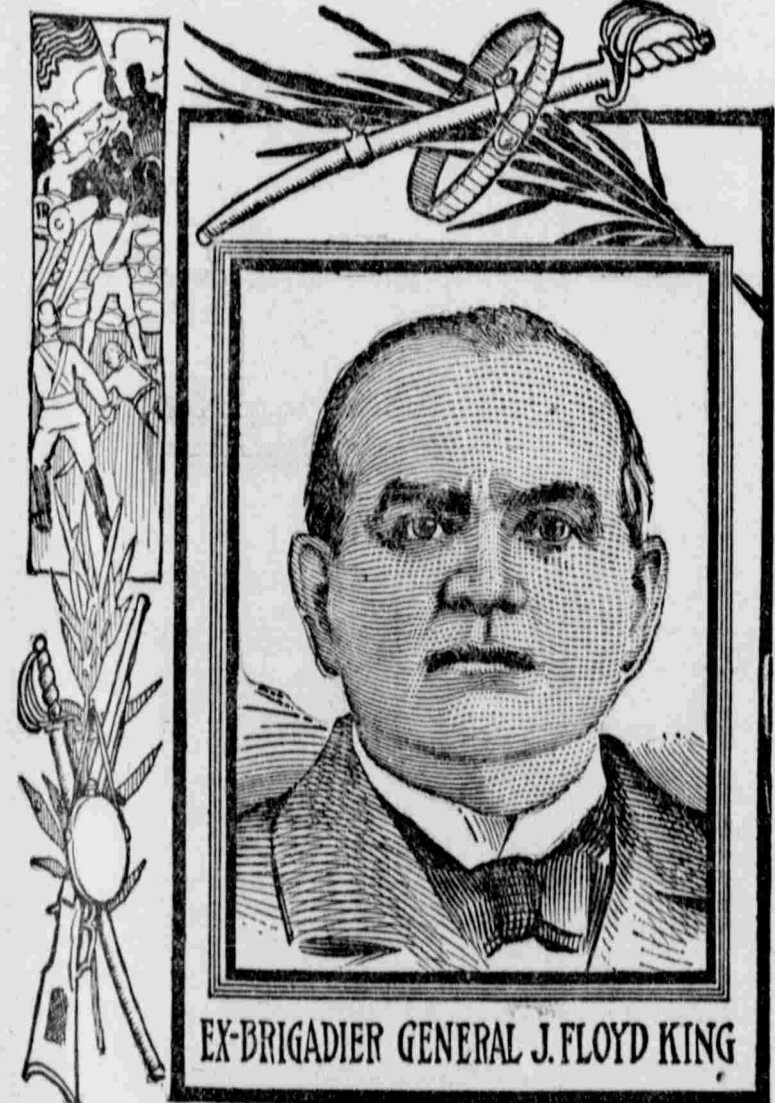
EX-BRIGADIER GENERAL J. FLOYD KING

The above testimonials are only specimens of the many thousand letters received touching the merits of Peruna as a catarrhal tonic. No more useful remedy to tone up the system has ever been devised by the medical profession.