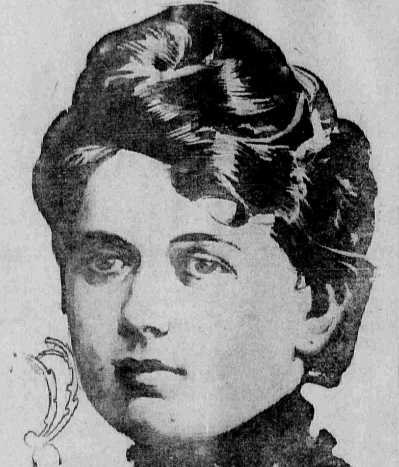
INTERESTING INTERNATIONAL ROMANCE.

Checked chiffon mohairs are among the smartest materials used this season for the jumper frock, an example of which is here illustrated.