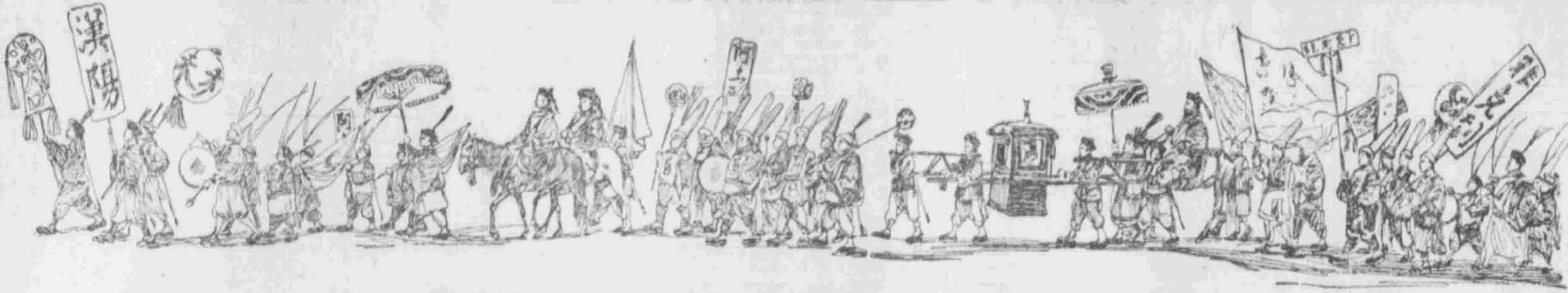
PROCESSION OF A CHINESE VICEROY ON THE WAY TO A FOREIGN LEGATION.