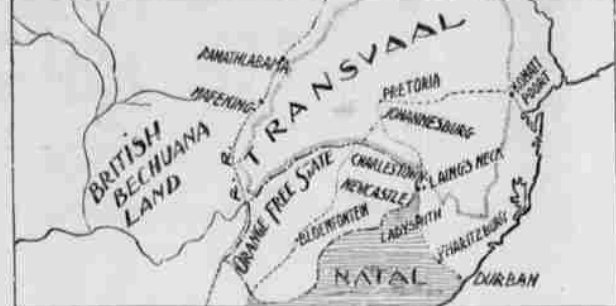
THE NATAL BORDER, WHERE HOSTILITIES WILL PROBABLY BEGIN.

New that hostilities may be inevitable in South Africa, all eyes are turned to the Natal border, where it is believed a battle will first occur. The Boers are expected to move from the Transvaal, where they are now gathered, and the Orange Free State troops are expected to move from the Orange Free State, where they are now gathered.