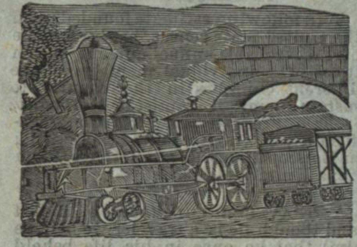
In THEATRE STREET, a few doors from MAIN STREET, G. S. L. City.