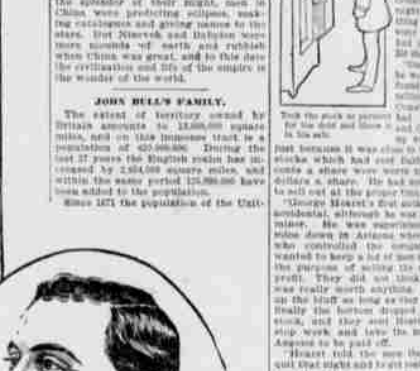
Finally the gun decided to by pulling in just one big