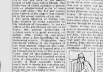
the spokes of their wheel, such as China, were predicting eclipses, such