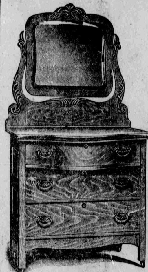
This DRESSER has a French plate bevel edge mirror $9.65

WE ARE SOLE AGENTS FOR KARPEN FURNITURE. At last we have secured the agency for Karpen guaranteed upholstered furniture. This line of upholstered furniture needs no introduction to the public, it is the oldest and best known make. We only carry Karpen upholstered furniture and Karpen sterling leather furniture, their steel construction is the very best made. Their finish cannot be equalled, their workmanship is the best. In visiting our store do not overlook this special department. Our house is the only place in town where Karpen's upholstered furniture can be found.