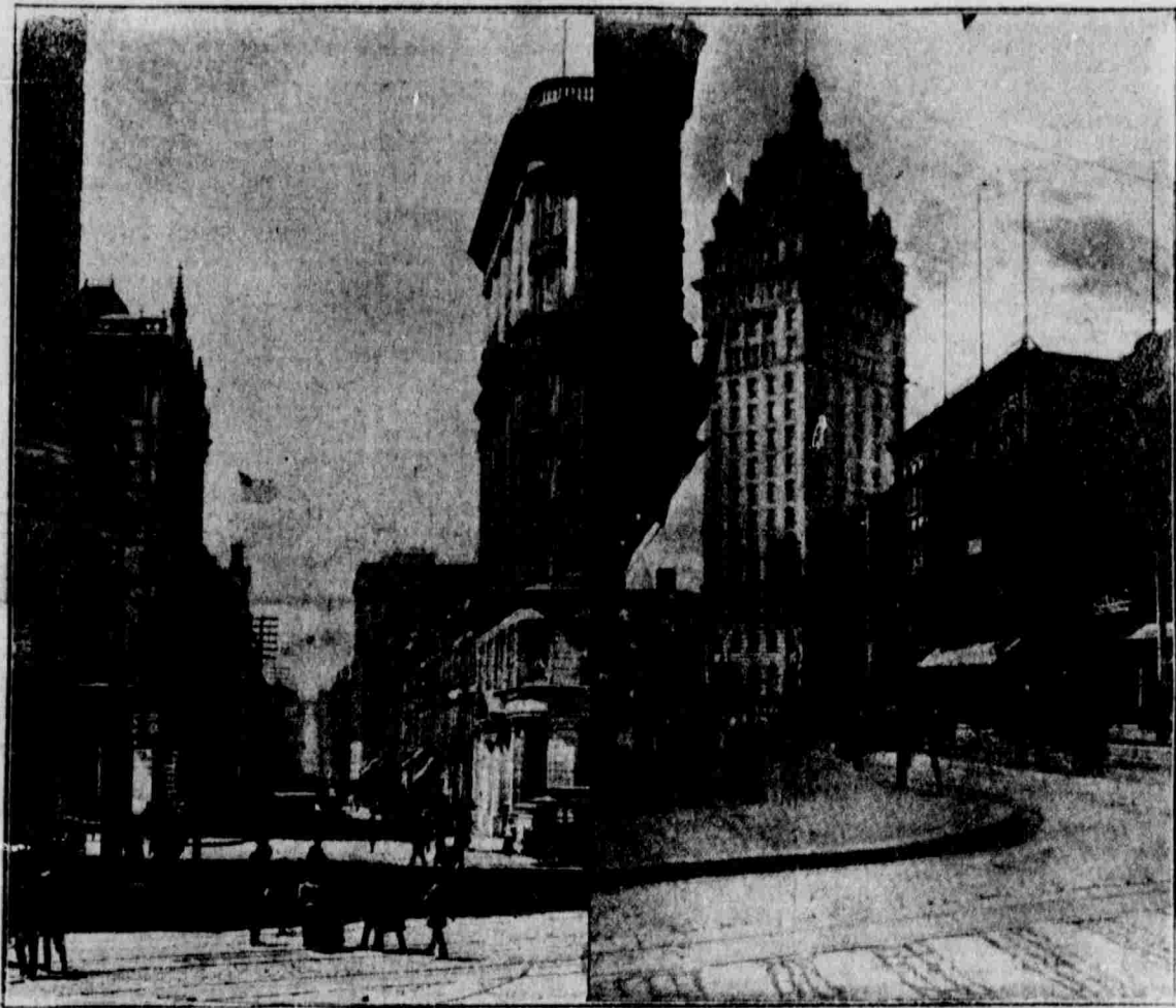
LOOKING UP MONTGOMERY AND DOWN KEARNEY STREETS. The High Building on the Right is a Twenty-One Store Structure, the Highest in San Francisco—The Latest Reports Say It is Being Destroyed by Fire.