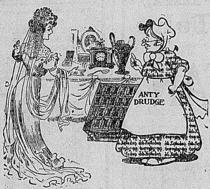
Anty Drudge at a Wedding.

Linens and all light weight Suits, go at— 1/2 Price Linen, Lawn, Madras, Lace and Net waists go at— 1/2 Price House Dresses 1/2 Price Peter Thompson Suits 1/2 Price Silk Suits, rajah and pongee, go at 1/3 Off Silk Petticoats and All Skirts go at 1/3 Off Lawn and Lingerie Dresses, also Lingerie Waists— 1/3 Off Extra special, one lot of Net Waists at— $2.00