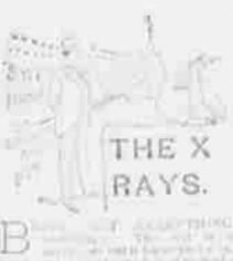
THE X RAYS.

Compare Yourselves with the People who are Paying Too Much for Their Goods and Services.