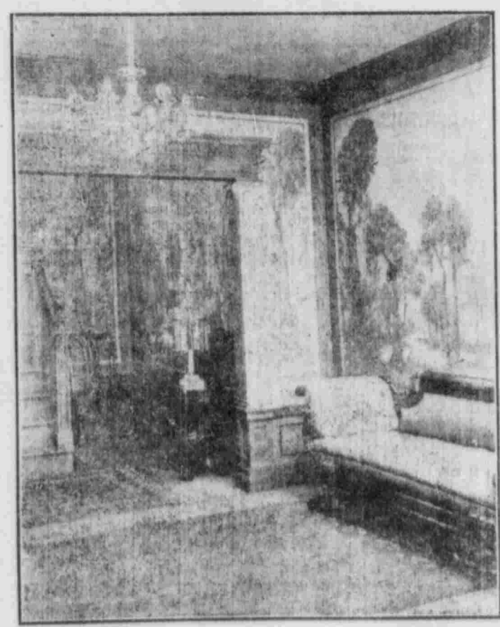
Copy of a famous Gobelin Tapestry Panel Effect, Landscape Scene, Suitable for Library, Dining Room or Large Reception Hall.

The Smartest and Newest Ideas in Wall and Window Decoration to be found anywhere.