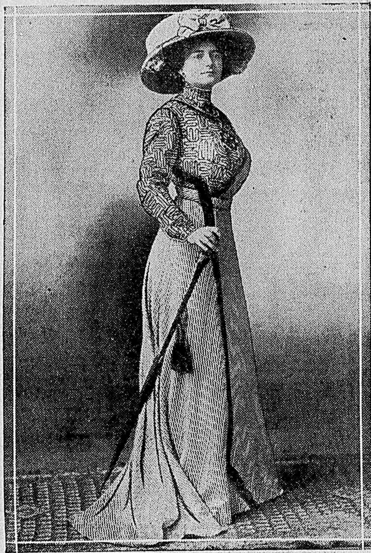
SILK FROCK WITH BRAIDED BODICE.