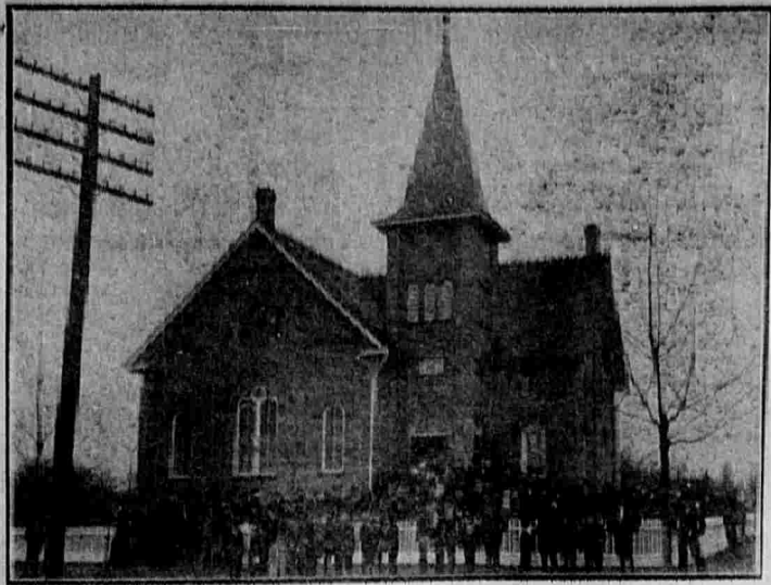
FIRST WARD CHAPEL.