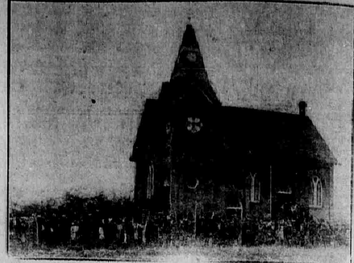
THIRD WARD CHAPEL.