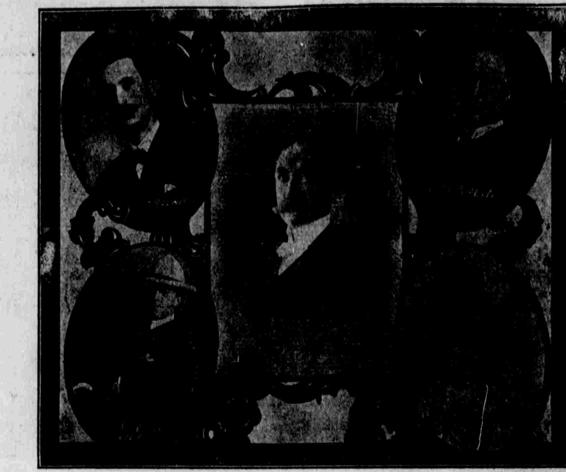
EXECUTIVE BOARD OF THE NEVADA CHAMBER OF COMMERCE.