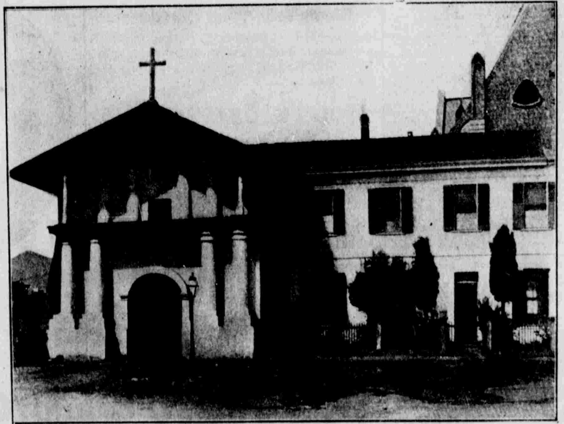
DOLORES MISSION, THE OLDEST HOUSE IN SAN FRANCISCO. This Notable Edifice Was First Built in 1776 and California's First Governor is Buried There—It is Now in Ruins.