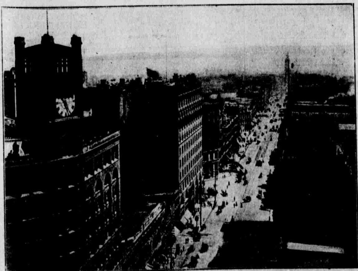
WHEN MARKET STREET WAS IN ITS GLORY, LOOKING EAST.