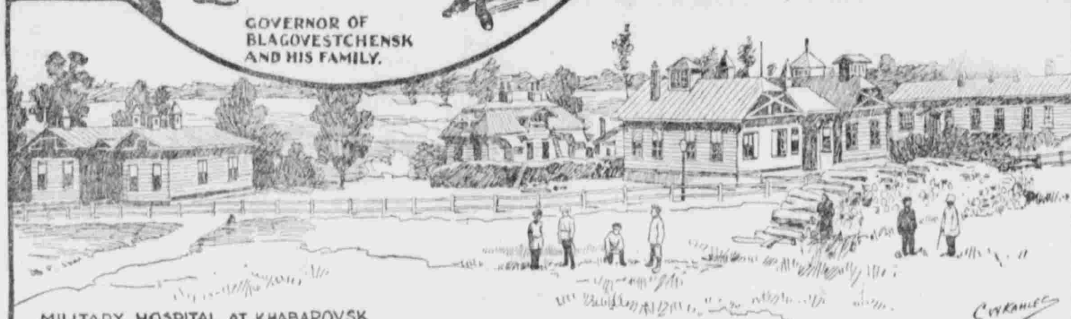
MILITARY HOSPITAL AT Khabarovsk.