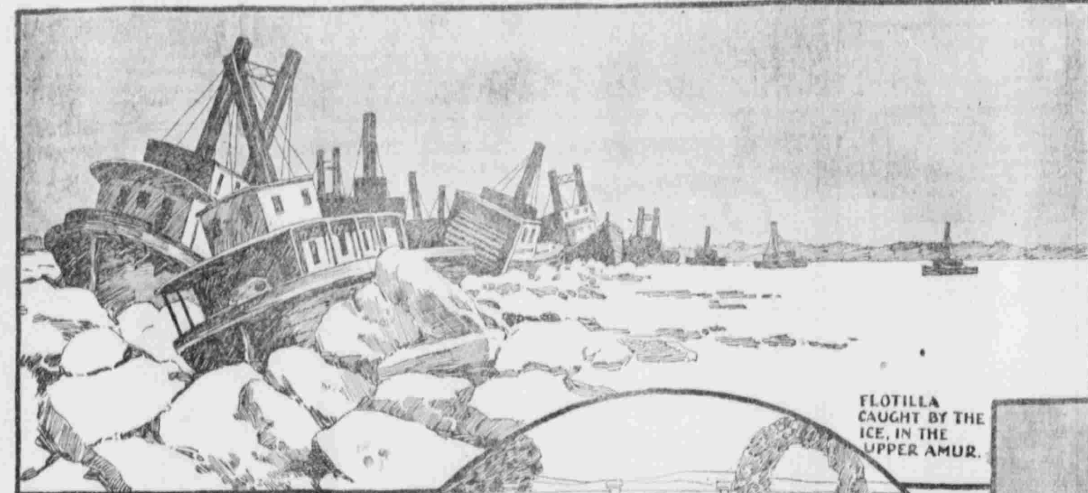
FLOTILLA CUGHT BY THE ICE, IN THE UPPER AMUR.

has been phenomenal, but the hopes indulged in respecting it have been somewhat dashed since the short-cut was projected across Manchuria, making Port Arthur, on the gulf of Pe-chili, the eastern terminus of the Transiberian line. Respecting Khabarovsk, which is situated at the junction of the Amur and its southern affluent, the Ussuri, less is known, for it has not long occupied the commanding position it now holds as the administrative center of the Siberian littoral. Here the great railroad takes a sudden turn southward to the sea, leaving the banks of the Amur and following the course of the Ussuri. It is a flourishing city at present, though its population of about 12,000 is fluctuating.