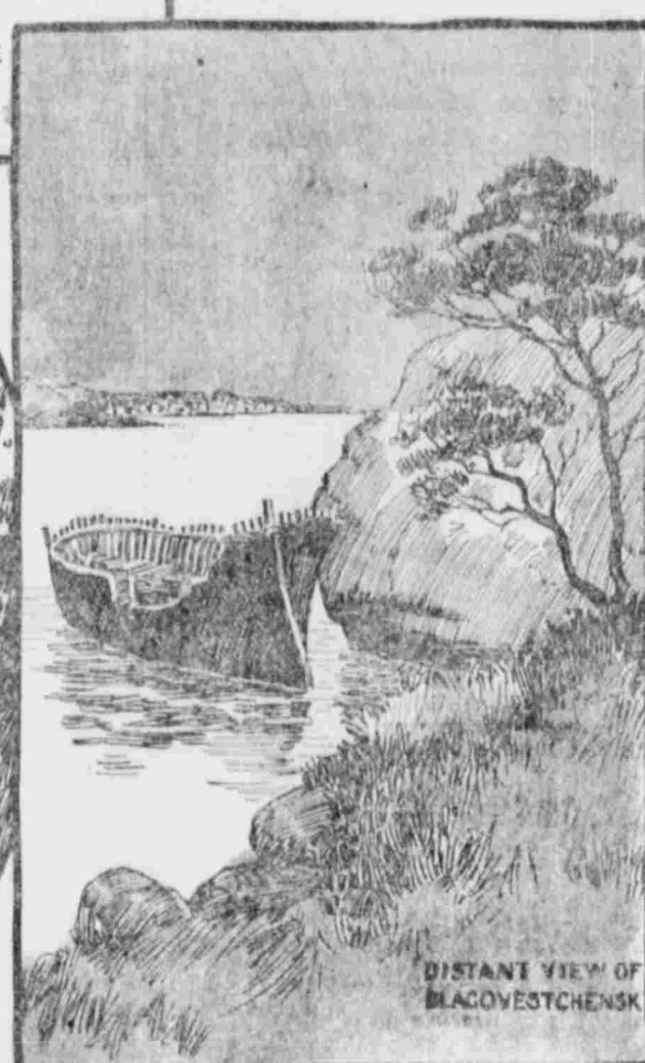
DISTANT VIEW OF BLAGOVESTCHENSK.