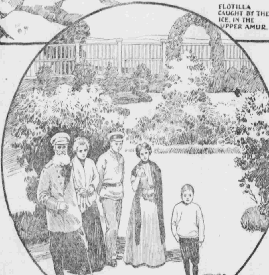
GOVERNOR OF BLAGOVESTCHENSK AND HIS FAMILY.

mounting in swift circles high into the air until the pursuer is tired out, or, having gained a sufficient height, by making a headlong drop in a slanting line for cover. This battle in the air is full of excitement, besides furnishing plenty of walking in the open air for the falconer.