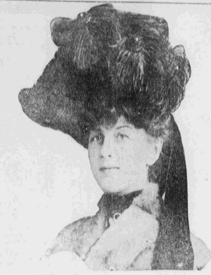
THE NAPOLEONIC BEAVER.

The pure, good tea, sold in packages only. M.J. Brandenstein & Co. Importers, ean Francisco.