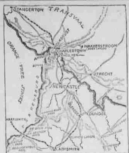
MAP SHOWING LOCATION OF GLENCOE.

London, Oct. 20.—The Daily Telegraph received the following from Lady... The Boers' summary defeat to be followed by bad news—new warcloud from South.