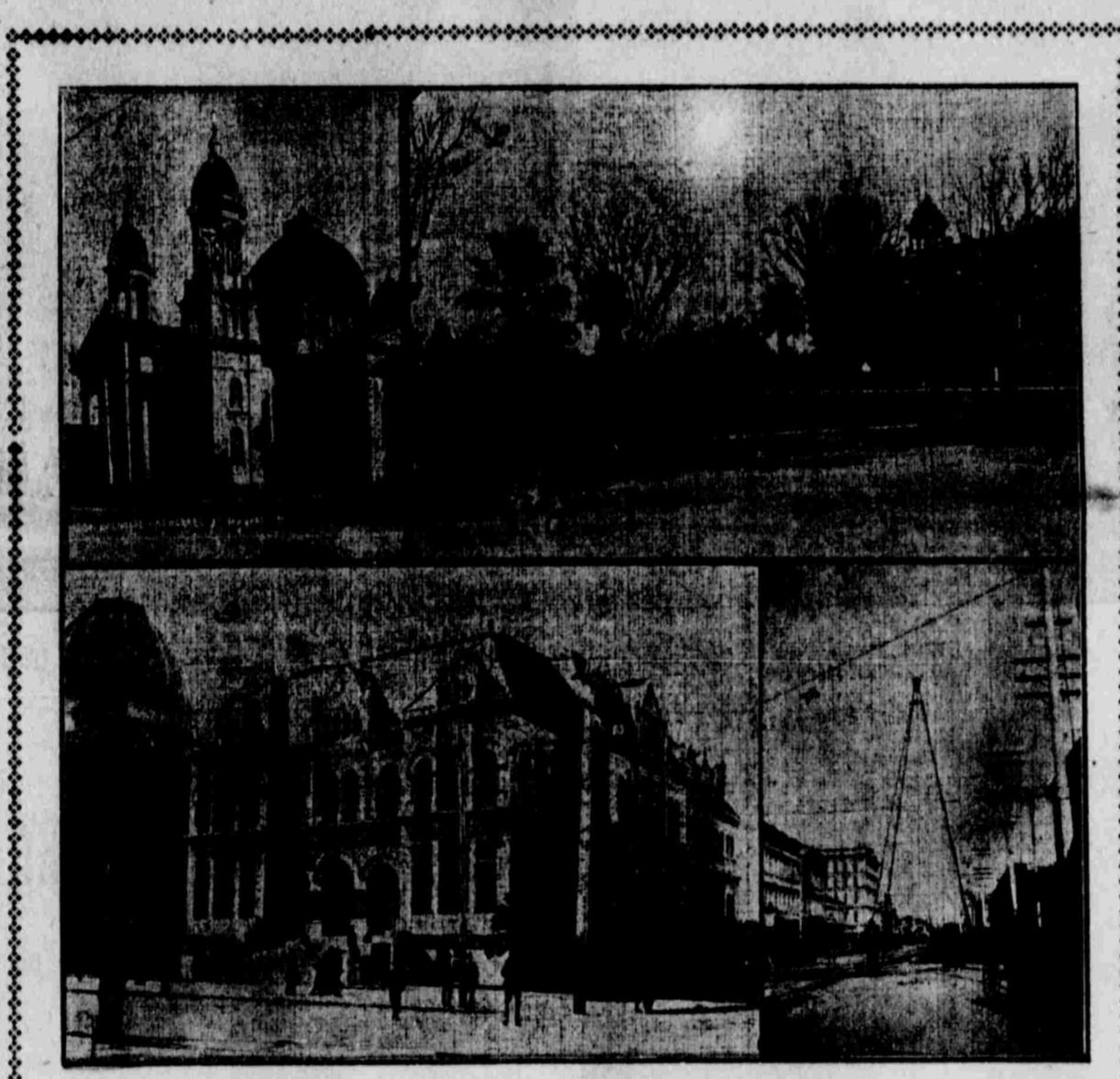
SCENES IN BEAUTIFUL BUT HAPLESS SAN JOSE. 1. Catholic Cathedral; 2. Park Hill Hotel; 3. City Hall; 4. Great Steel Electric Light Tower 250 Feet High.

The water supply was entirely cut off, and may be it was just as well, for the lines of fire department at any stage. Assistant Chief Dougherty supervised the work of his men and early in the morning it was seen that the only possible chance to save the city lay in effort to check the flames by the use of dynamite. During the day a blast could be heard in any section at intervals of only a few minutes, and buildings not destroyed by fire were blown to atoms. But through the gaps made the flames jumped and although the failures of the heroic efforts of the police, firemen and soldiers were at times sickening, the work was continued with a desperation that will live as one of the features of the terrible disaster.