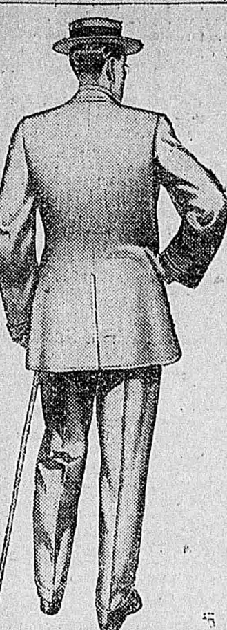
Copyright 1909 Affiliated Benjamin & Co. MAKERS NEW YORK